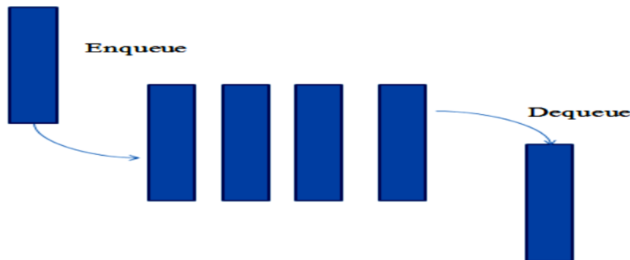
Fig. 2 Fifo Queue

Video File can be received in FIFO order at the Receiver Side. The FIFO Receives Raw Video Data, buffers the raw capture Video Data at a rate, and transfers the raw capture Video data to the High Speed Memory. The Host FIFO Receives display Video Data from a remote source, Buffers the Display Video Data, and Transfers the input display Video data to the High Speed Memory. The PB FIFO reads capture Video Data and Display Video Data, During The PB Service, from the High Speed Memory to Provide an Input Queue for Video Compression and Video Decompression. The Display FIFO Receives, during the Display Service, Display Video Data from The High Speed Memory, and Buffers the Display Video data to Provide the Display Video Data at a Display Rate for the Host.