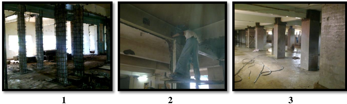
Fig. 2 Photographs shows the step by step stages of retrofitting work for the considered Health Building at Nashik

The estimated cost of retrofitting the existing structure is 4.5 crore. To meet the further requirement of infrastructure the management now is constructing additional new building with G + 2 storey, instead of razing the existing building.