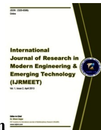
Chairman (RAIJMR) www.raijmr.com